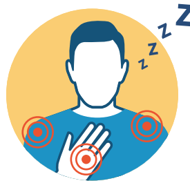
MUSCLE PAIN AND FATIGUE