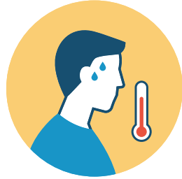
FEVER 100.4* *or school board policy if threshold is lower