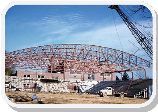
Middle School West Gym being Constructed