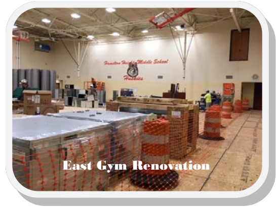
East Gym Renovation

Construction started at the Middle School renovating the West gym locker rooms and the East Gym. Beginning June 4th additional construction will begin in the West gym, concession area and in the public restrooms. During the project a majority of Mechanical, Electrical, and Plumbing is being replaced in areas of the building that are scheduled to remain. Final construction renovation will occur beginning August of 2020 and should be completed by August 2021.