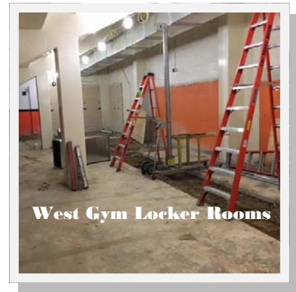
West Gym Locker Rooms